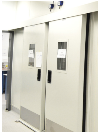
BI-PART HORIZONTAL SLIDING