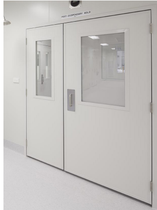
DOUBLE FLUSH SWING