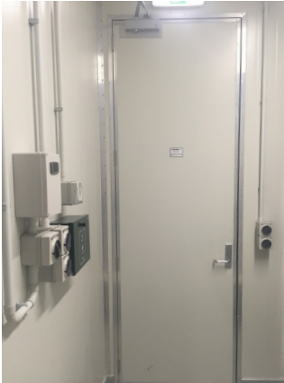
SINGLE FLUSH SWING